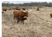
TOF Rider's Run