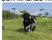
SOR MASKED RIDER