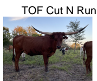
TOF Cut N Run